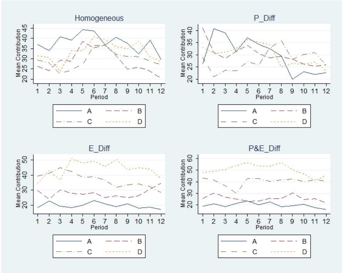
Figure 2: Contributions by subject-type in the four treatments.

While we do not observe any remarkable differences in contributions across subject-types in the two treatments with homogeneous endowments, there is a clear positive relationship between contributions and endowments in E_Diff and P&E_Diff whereby the wealthier subject, D , makes the largest contributions (the mean overall contribution is 50.428 in P&E_Diff and 43.972 in E_Diff ), followed by C (40.272 in P&E_Diff and 36.844 in E_Diff ), B (25.583 in P&E_Diff and 28.028 in E_Diff ) and A , the poorest subject in the group (19.806 in P&E_Diff and 19.833 in E_Diff ).