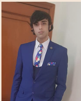
Umaid A. Sheikh

Abstract: The study is intended to investigate the symmetrical relationship between macroeconomic variability and KSE-100 indexes by employing the ARDL model with bound testing procedure and error correction model. Authors have also examined whether the linkages between macroeconomic variability and KSE-100 indexes change in the wake of the 2008 Global economic recession. Macroeconomic variability is represented by fluctuations in interest rates, consumer price index, and Money supply (M2). Monthly level data representing macroeconomic volatility has been incorporated from the trading economics website and validated from the Pakistan bureau of statistics. Four different types of unit root tests like augmented dickey fuller test, KPSS, and Philips Peron unit root are also employed for the identification of seasonality effects in data. To identify structural breaks and linearity in data, the Zivot Andrew unit root test and BDS test for nonlinearity have also been employed respectively. This study adds to the existing literature by classifying