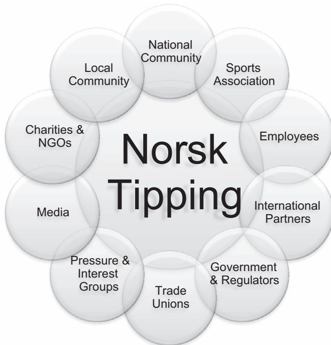
Figure 12.1 Examples of Some of Norsk Tipping's Stakeholders

One of the best lessons we can learn from PJS's experience is just how complex, challenging, and changeable crises will seem once we consider the environments in which organizations operate. Both organizations and organizational actors are subject to many pressures because they serve multiple stakeholders (Connolly et al., 1980; Frooman, 1999). These stakeholders range widely. They can include groups such as employees, customers or clients, regulators, and competitors (Figure 12.1).