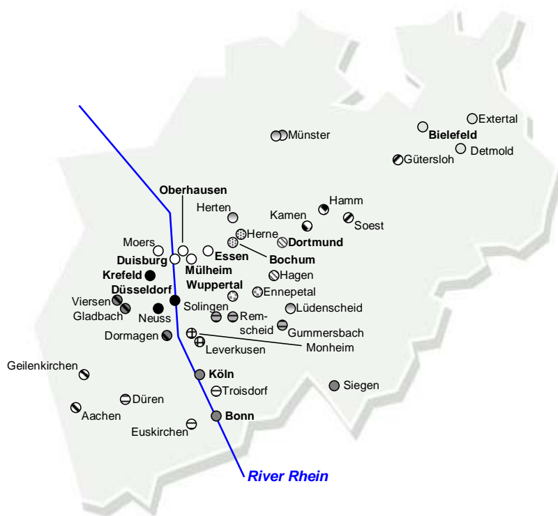
Figure 1: Geography of local public transport mergers in North Rhine-Westphalia

Legend: Tram or light railway operators in bold font Different shadings relate to the mergers ○ Not merged companies