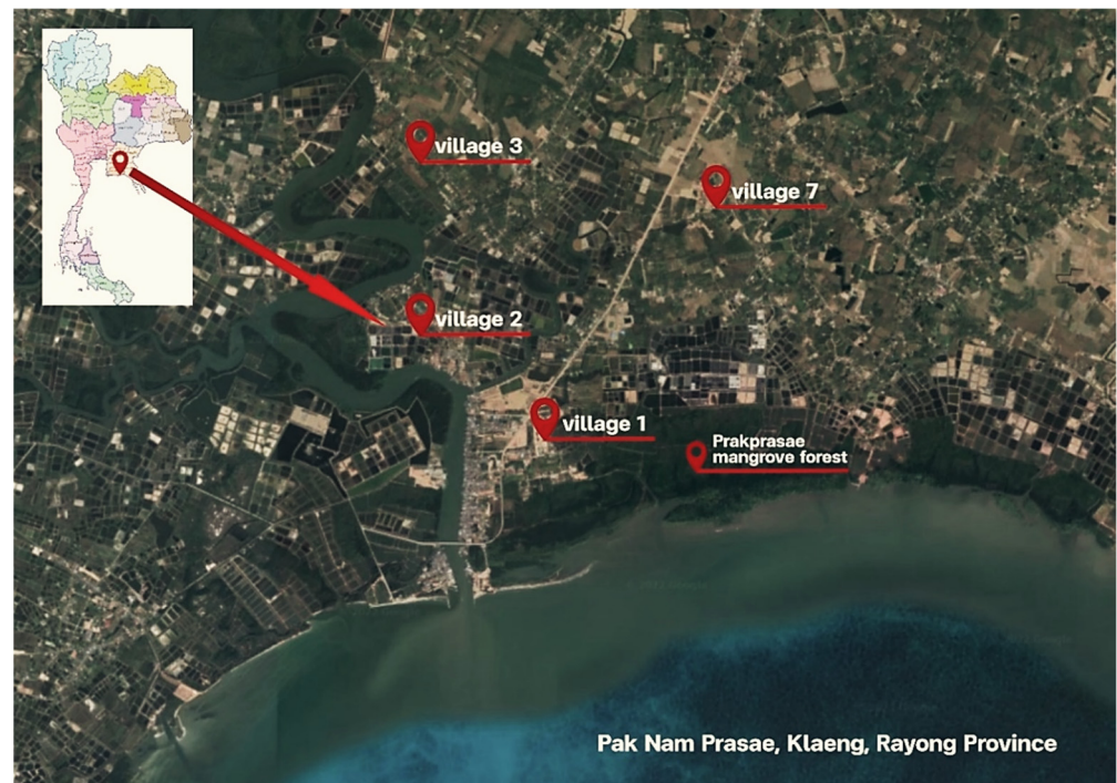
Figure 2. Study area.

mangrove forest area and to conserve the mangrove forest situated in the Pakprasae sub-district [14] (see Figure 2). The total area of the Prakprasae mangrove forest is 9.6 km 2 . The project also intended to release 10,000 young fish within the project area to recover the mangrove ecosystem. Most importantly, ecotourism in the area has also been promoted by several activities, such as sustainable production of local products, planting mangrove trees, sightseeing mangrove forest scenery, etc. Four local communities (Villages 1, 2, 3, and 7) are situated adjacent to the Prakprasae mangrove forest area and are targeted by this CSR project for livelihood and well-being improvement. These communities included 3133 people [95]. These people have been encouraged to participate in the CPF GSPMF project since 2014.