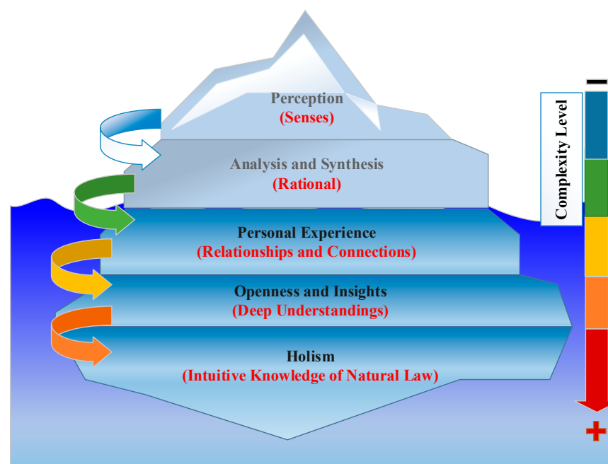
Figure 1. The Iceberg model of decision-making and problem-solving.

Surveys of literature present a varied panorama about the meanings and usefulness of intuition and analysis. The interviews with respondents have confirmed and expanded literature findings and are now elaborated to produce a model (Figure 1). The iceberg model presented below emerged from integration of literature findings, the research problems arising therefrom, and the interview results. An early form of the model was shared with subject matter experts from systems thinking, management and psychology to gain their views and slight modifications were then included in the final model. The model is illustrated with examples to help senior leaders to come to better comprehend the steps involved.