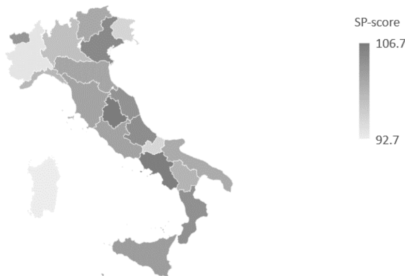
Figure 1. SP-score—Innovative start-ups. Map of Italian regions.

Figure 1 shows graphically the homogeneity described above among Italian regions. The regions indicated with a darker color are those with a higher SP-score of innovative start-ups. No obvious spatial concentrations of high performance can be found. Innovative start-ups have a higher or lower index regardless of their location.