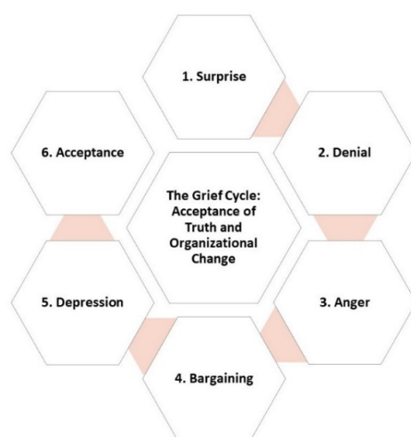
Figure 2. Six phases of grief leading to acceptance of the truth and buy-in to organizational change. Simplified and recreated from Stokke (2014).