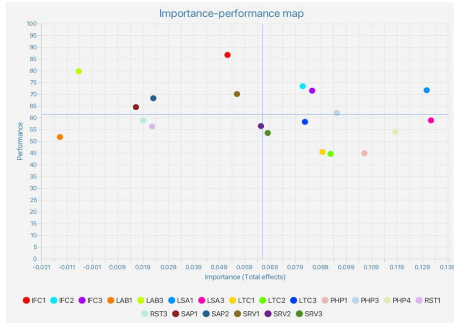
Figure 3. Importance-performance map of indicators.

The results of the PLS-SEM analysis with the coefficient value are described in Figure 4 as the empirical model. Based on this result, the proposed model has adequate capability to predict behavioural intentions in the context of clinical laboratory services.