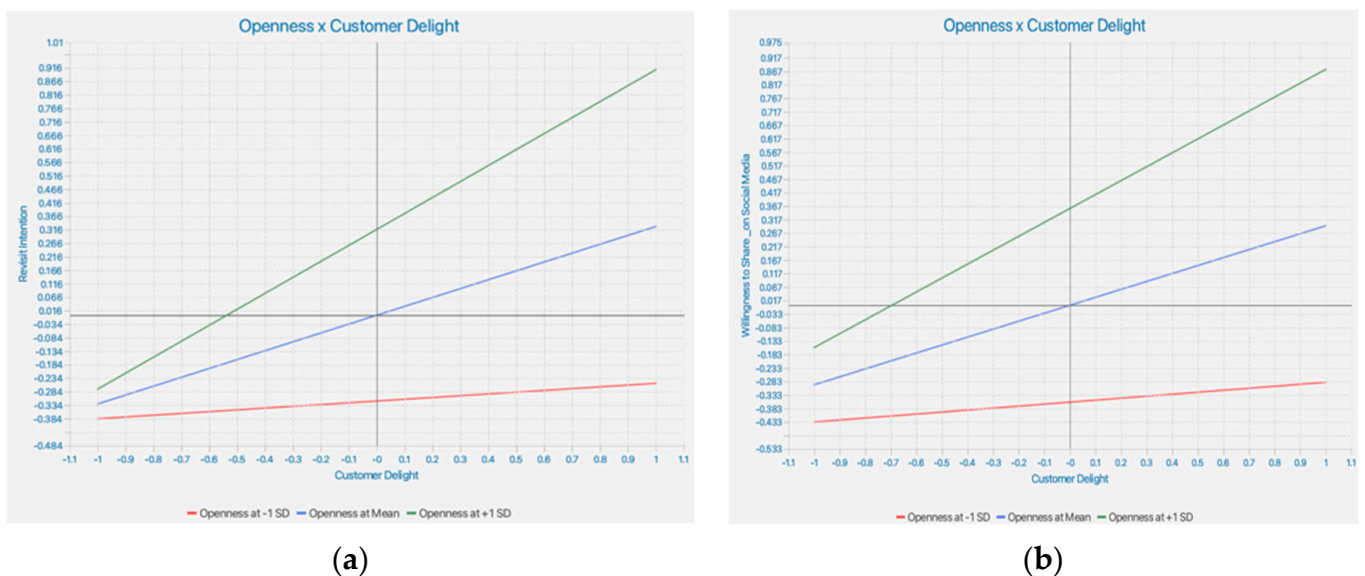
Figure 2. Simple slope analysis: (a) Moderation effect of OPS on the impact of CDL to RVI; (b) Moderation effect of OPS on the impact of CDL to WSP.

Figure 2 depicts the influence of the OPS moderating variable in the clinical laboratory in the form of a simple slope analysis. Figure 2a shows a linear relationship in which the higher the tendency of OPS, the greater the influence of CDL on RVI (+1 SD). Figure 2b also shows a linear relationship in which the higher the tendency of OPS, the greater the influence of CDL on WSP (+1 SD).