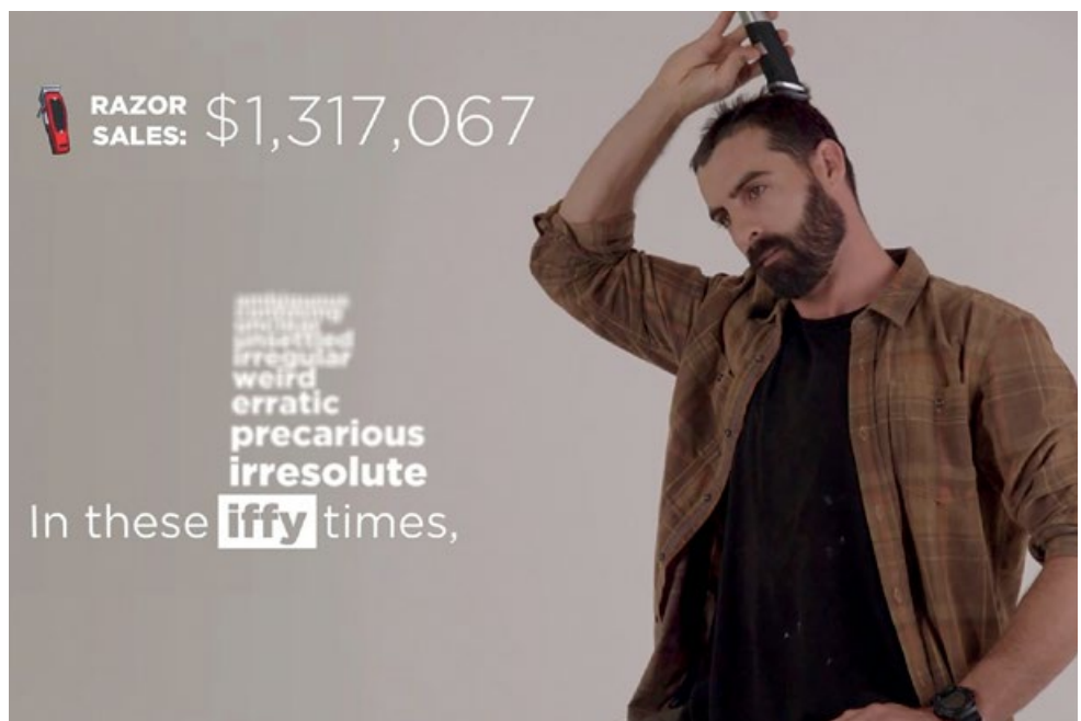
Purpose ‘In these uncertain times’ Everything sounds the same