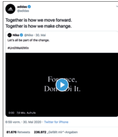
"For once, don't do it" Twitter post in support of the anti-racism movement.

The best marketers in the world understand marketing can't be a cheap trick. Sure, cheap tricks will work once or twice, but to be truly impactful marketing needs alignment with the strategy and the culture of an organization. The management consultant Peter Drucker is credited for coming up with the quo-