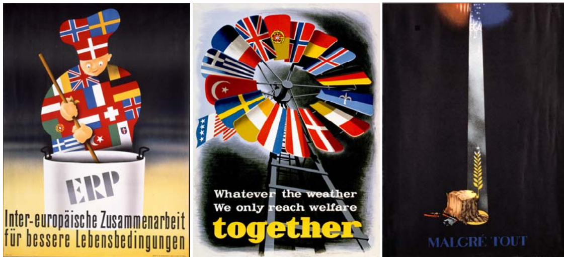
Image 3 to 5: Marshall Plan Posters, 1950: Fourth and Fifth Prize Winners 16

gan "You hold the key" and shows a giant key inscribed with sheaves of wheat, its blade lined with European flags, and "ERP" in large red letters in the middle of the key ring. In a Swedish poster, a pair of red, white and blue pruning shears labeled "Marshall Aid" lie across a strand of barbed wire; in an Austrian contribution, a broken off tree with an American flag near its roots sprouts new growth and doves build a nest of European flags; another Dutch artist portrayed a windmill with many blades comprised of European flags, and the American flag as rudder; and in a poster by a Turkish artist, an ethereal celestial body comprised of American stars and stripes beams a shaft of light down on a dead tree stump, and a sheaf of wheat sprouts out the side (see illustrations).