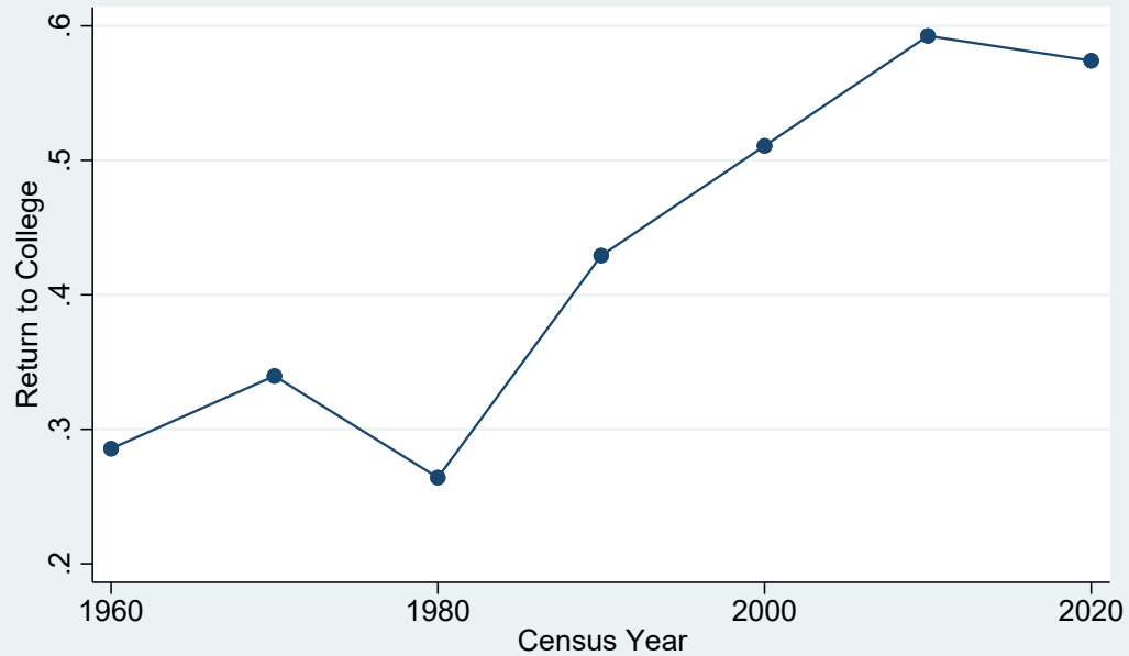
Figure 3: The Log Wage Return to a College Degree White, Native Men who work Full Time

The graph plots the mean state-level return to college for white, native men who work full time. The return to college (relative to high school graduates) controls for age and uses a sample of white, native men between ages 25-49 who work full-time.