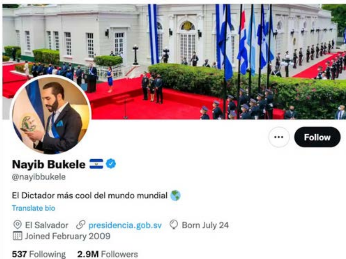
Figure 1: Bukele on social media