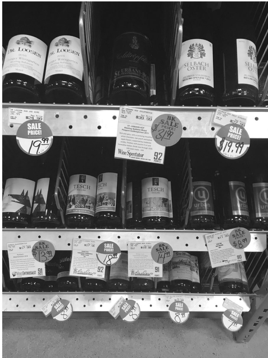
Fig. 1. The Riesling isle of a local wine store in New Jersey, USA; only 90 + ratings are noted.

a new collection – a “premium wine division” which exclusively offers wines with “a minimum of 90 points.” 6