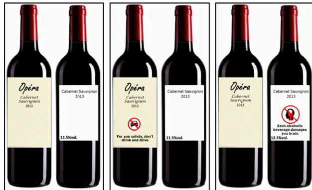
Figure 1. An example of choice task for wine and beer.