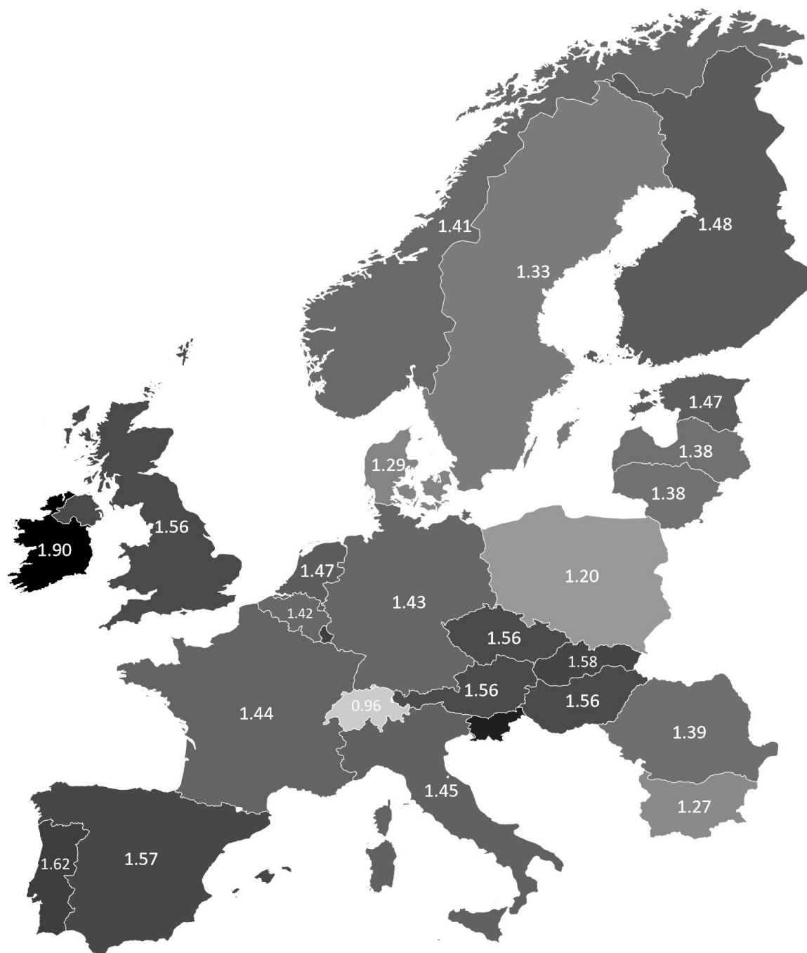
Figure 1: Ireland and Slovenia Show the Highest Values of \mu , Switzerland the Lowest

Note: Slovenia indicates \mu_{SI} = 1.77 , Luxembourg \mu_{LU} = 1.61 , Malta \mu_{MT} = 1.59 , Cyprus \mu_{CY} = 1.57 , Iceland \mu_{CY} = 1.40 and Greece \mu_{EL} = 1.37 . We use fixed effect pooling method.