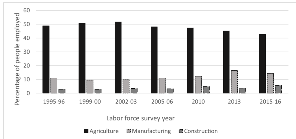
Fig. 1 Distribution of labor force above 15 years

Before the 1990s, Bangladesh rice market was isolated from the international markets. Trade liberalization during the 1990s helped to reduce production cost and raised profitability of the rice sector (Ahmed, 1999). Private businesses played a great role in responding quickly to the market demands through rice imports, mainly from India. However, supported by the National Food Policy Plan of Action