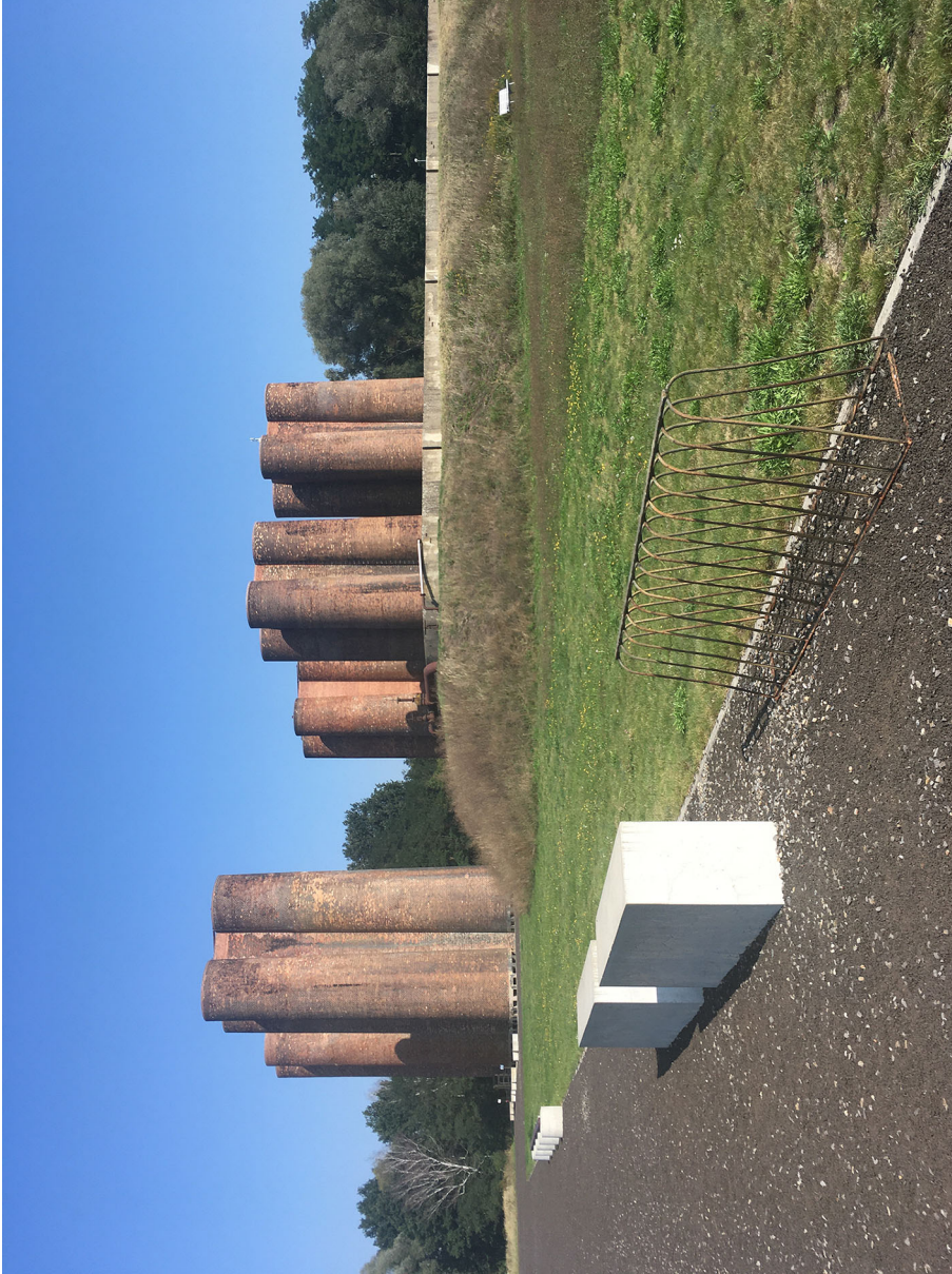
FIGURE 3 The last remnants of lignite processing industries in Lauchhammer, the so-called biotowers, photo: author.