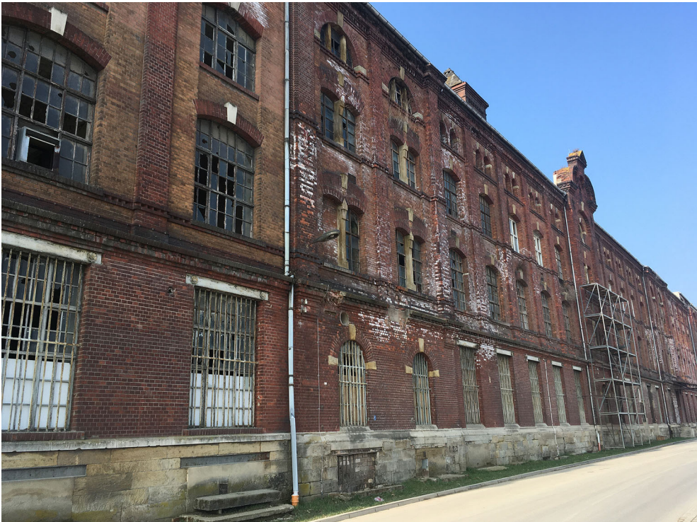
FIGURE 2 Abandoned factory in Zeitz

Actors in both towns have portrayed themselves as victims of decisions made elsewhere in the aftermath of German reunification, and reported in the interviews that in the past their towns had been largely neglected by regional and federal politicians. This is still felt particularly in Zeitz, where the planned lignite phase out is perceived as yet another decision which they could not influence. The nearby operating mines are still an important part of