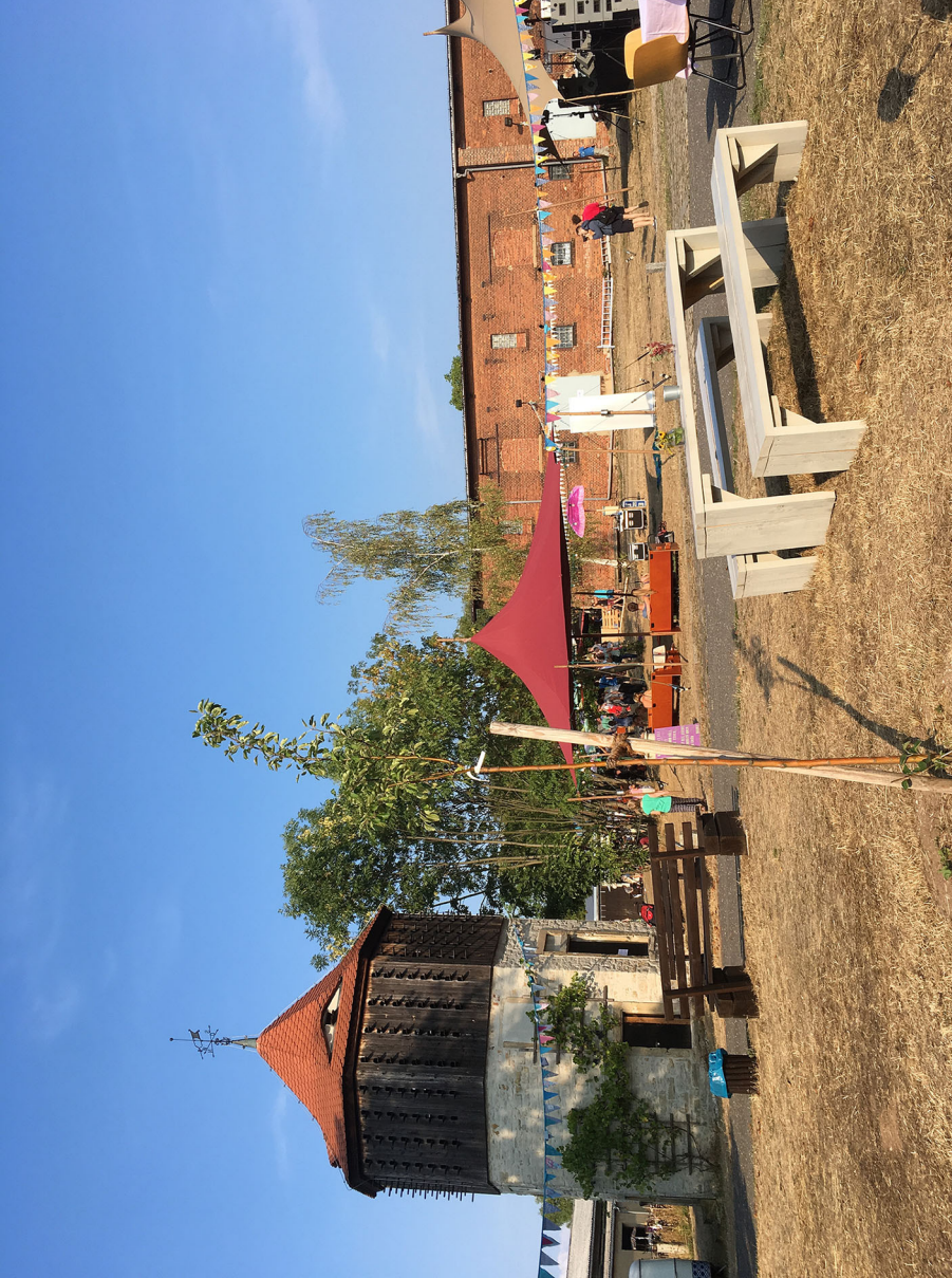
FIGURE 5 Posa Calling Festival, 2018, at Kloster Posa in Zeitz, photo: author.