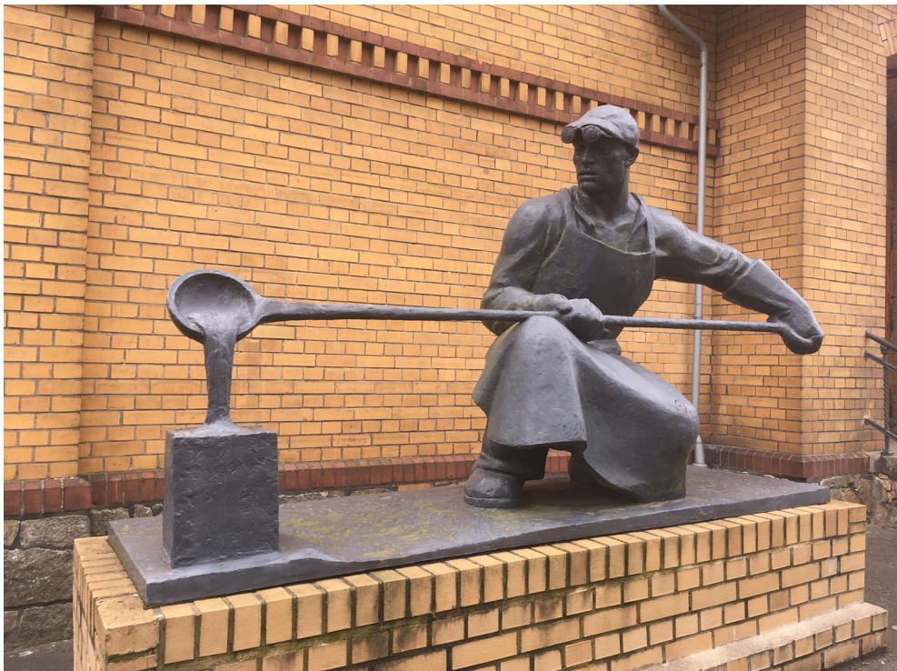
FIGURE 4 Statue in front of the art foundry museum in Lauchhammer