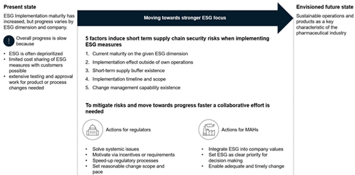
FIGURE 2 Findings and the related identified themes from semi-structured interviews. Participants' views on the current state of ESG implementation maturity, ambitions for the future, and potential effects on supply chain security when implementing ESG measures.

early days in the pharmaceutical industry.”) and agree that ambitions should be increased (“There is still way too little ambition to really make a change and put more research effort into this.”). Three sub-themes linked to the reasons for the limited progress on ESG topics were developed.