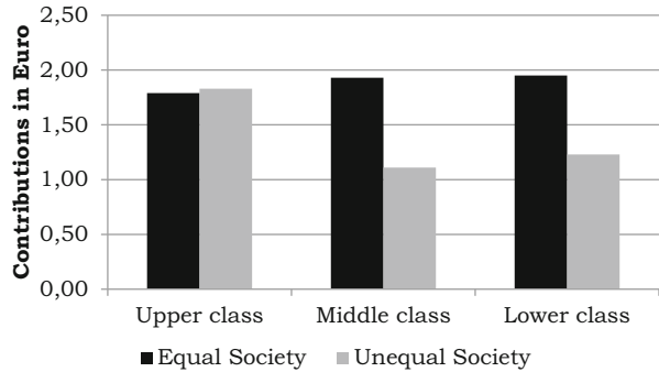
Fig. 2 Public-good game contributions separated by society and class affiliation

on motivated reasoning. But we are not able to provide any other (e.g., process) data to further validate that notion.