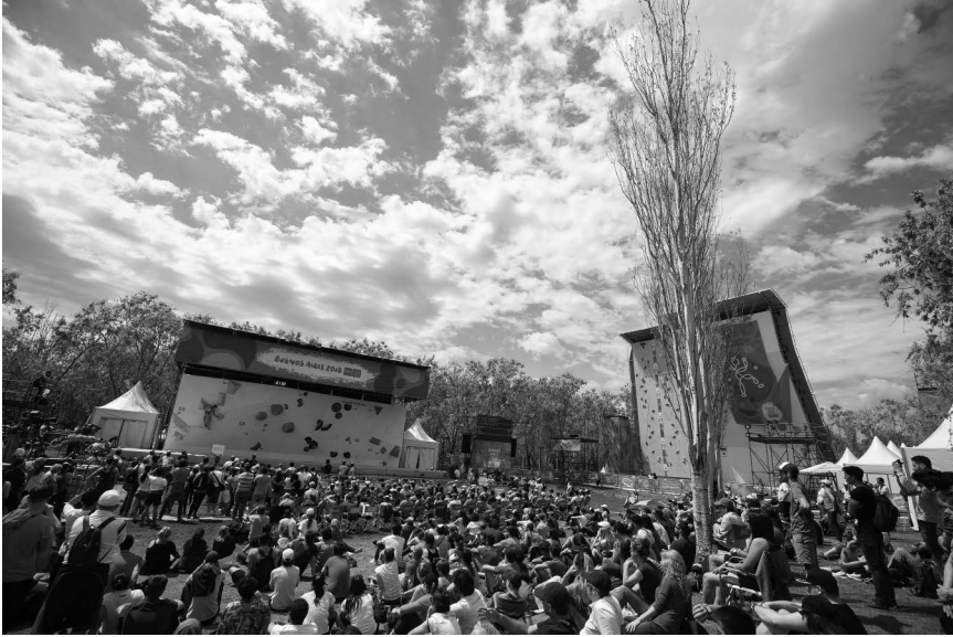
Figure 6.1 Sport-climbing at the Buenos Aires 2018 YOG, with the speed, lead, and bouldering combined event held in the same space in the Urban Park. Photo courtesy of: Ivo Gonzalez for OIS/IOC. Used with permission of the International Olympic Committee (IOC). All rights reserved.

the different approach adopted by the IFSC in working with the IOC. Not dissimilar from surfing and skateboarding, however, the IFSC is facing difficult decisions as to how to grow the sport and harness the increased attention into support without losing touch with the core of the climbing community. The following quote illustrates this concern in relation to sponsorship and the need to maintain close connections with the culture: