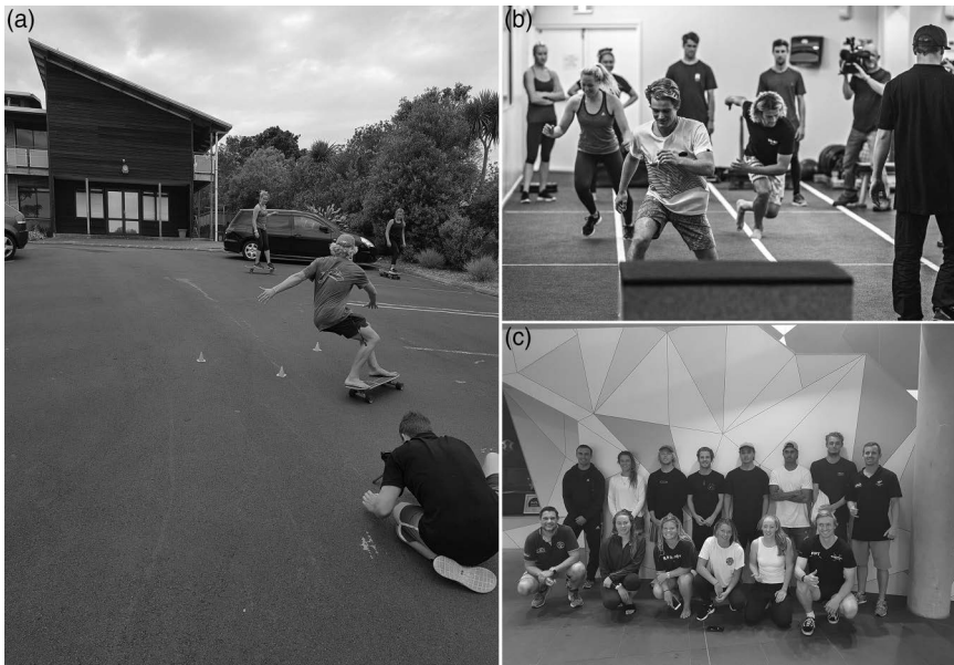
Figures 10.1 (a–c) New Zealand Olympic surfers training camp.

SNZ said there were around 40 children and youth that went to get coaching in Australia each year, including to Australia’s state of the art High Performance Centre on the Gold Coast. Despite the availability of consistent waves in Aotearoa, few events attracted international athletes, thus limiting the standard of competition. The lack of a serious competition pathway and smaller groups of serious competitors, has long limited the progression of surfers in Aotearoa: