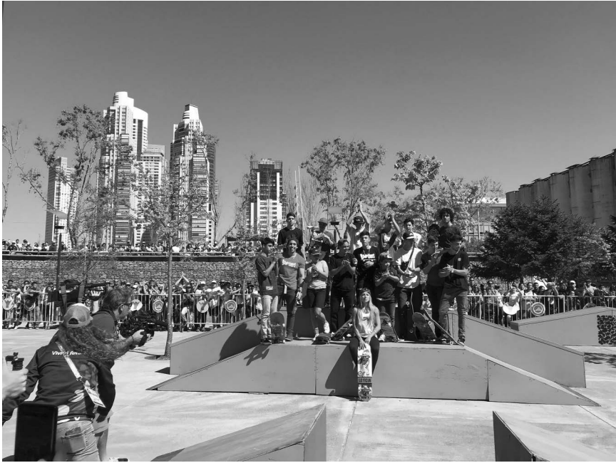
Figure 8.6 Male and female professional US skateboarders casually share the platform with national Argentinian skateboarders, at the skateboarding exhibition at the Urban Park in Buenos Aires.