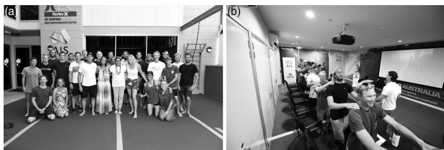
Figures 10.3 (a, b) Surfing Australia's first Olympic Readiness Camp.

Initially a “three-day Olympic Readiness Camp” (January 2018) was designed to bring the surfers together for “planning, education, and the establishment of what will be a Team Australia culture as we head to Japan” (Surfing Australia News, 2018). Invitees included 24 targeted Olympic surfers (8 did not attend), former Australian surfers, The Australian Olympic Committee, and former Olympic Gold Medallists Cathy Freeman and Ken Wallace (Surfing Australia News, 2018). Crane was still unconvinced she had buy-in from the surfing culture, and admitted that in the days running up to the event, she was very nervous about how her ideas would be received by those entrenched in the individualised surfing culture by acknowledging that a “massive cultural shift” would be required (Figures 10.3(a,b)).