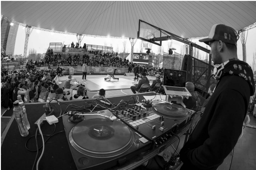
Figures 8.1–8.4 Images from the Buenos Aires 2018 Youth Olympic Games Urban Park, showing climbing (8.1), breaking (8.2), and skateboarding (8.3) with audiences close to the action, and enjoying the ‘festival’ feel of the events, including live music (8.2 and 8.4). Used with permission of the International Olympic Committee (IOC). All rights reserved. (8.1) Photo courtesy of Lukas Schulze for OIS/IOC. (8.2) Photo courtesy of Simon Bruty for OIS/IOC. (8.3) Photo courtesy of Simon Bruty for OIS/IOC. (8.4) Personal archive.