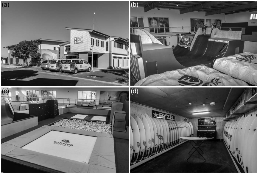
Figures 10.2 (a–d) The Australian High Performance Surfing Centre.

This led to a new structure for SA; they decided to invest in a National High-Performance Director, a role that was advertised internationally, with Kim Crane appointed (September, 2017).