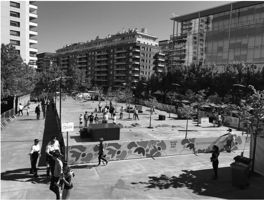
Figure 6.3 A rudimentary parkour course set-up alongside the skateboarding ‘have a go’ park (mostly for children to learn) in the Urban Park at the Buenos Aires Youth Olympic Games.

The example of parkour highlights the ongoing and complex relationships between action sports, international governance, and the Olympic Games. In particular, Parkour Earth’s continued development and activism, the IPFs recent MoU with World Obstacle Course Racing with the aim of growing obstacle sports collaboratively with FIG (Houston, 2020), and a 2020 statement by FIG’s Vice President, Nellie Kim, calling their pursuit of parkour into question (Pavitt, 2020), all signpost the contested nature of the relationship between parkour and the Olympic Games. While there is certainly a desire from the IOC and FIG to incorporate more youthful and urban-focused activities under the umbrella of ‘gymnastics’, the (increasingly fragmented) international parkour community is also highly motivated to maintain its autonomy. Put simply, this is a battle over the future control, organisation, and definition of parkour.