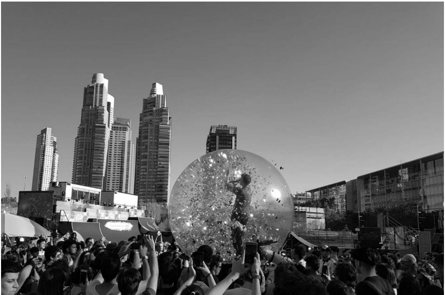
Figures 8.1–8.4 (Continued)

was also shared on the Olympic Channel, with social media playing an important role. The athletes and invited influencers were encouraged to actively use social media, “ensuring that fans on the ground and around the world were brought closer to the Olympic action than ever before” (From Buenos Aires, 2019). Such strategic efforts to break down the boundaries between the athletes and audience