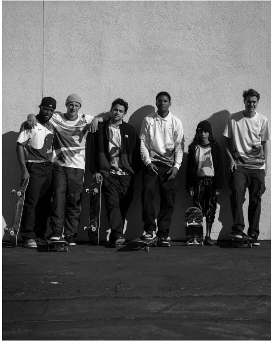
Figure 8.7 Image of Nike SB uniforms designed for the Brazilian, French, and USA skateboarding teams. Used with permission from Nike.

Therefore, to those in the skateboarding industry, uniforms are a battle over the power to define the skateboarding body and to reap the financial benefits.