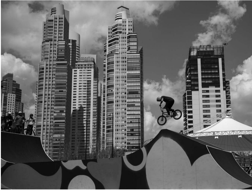
Figures 6.2 A BMX freestyle athlete performs on the FISE/Hurricane Park in the Urban Park at the Buenos Aires 2018 Youth Olympic Games.

wakestyle, big air, park, and surfing. The young sport has been through a variety of governance models (and internal challenges), but is currently governed by the International Kiteboarding Association (IKA) and Global Kitesports Association (GKA). Although IKA and GKA are run by kiteboarders themselves, they have different orientations—racing and freestyle, respectively—and operate under the parent organisation of World Sailing (previously ISAF). The relationship with kiteboarding and World Sailing, however, has a longer, more complicated history.