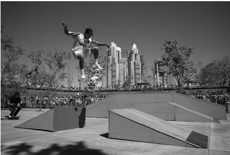
Figure 8.5 US professional skateboarder Nyjah Huston was a huge draw-card for youth to the Buenos Aires Urban Park. Huston and other invited skaters (including Bufoni and Hawk) participated in a demonstration with local skateboarders. Photo courtesy of Dylan Burns for OIS/IOC. Used with permission of the International Olympic Committee (IOC). All rights reserved.

The Tokyo Organizing Committee (OC) was in attendance at the Buenos Aires Urban Park, and in July the following year announced that the Tokyo Waterfront City area would “offer a buzzing festival environment that brings fans closer to the Olympic action than ever before” (Tokyo 2020 Takes Sport to the People, 2019). The Tokyo Waterfront City area includes both the Urban Festival and the Playground concepts, with the former taking place across the Ariake Urban Sports Parks (where fans can watch the BMX racing, BMX freestyle and