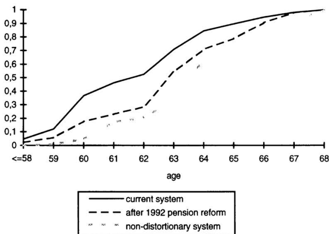
Figure 3: Estimated cumulative retirement probabilities (German and foreign males)

By replacing the original values of the income variables with the ones corresponding to the two alternative policy régimes studied here and subsequently re-estimating the age-specific retirement probabilities on the basis of these newly generated arguments, an estimate of the effect these policies can be obtained. In figure 3, the result of such an experiment is summarized.