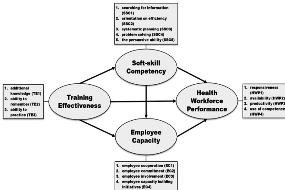
Figure 1. Conceptual Framework.

This study was conducted on health workers in South Sulawesi Province during the COVID-19 pandemic. As the largest province in eastern Indonesia, the number of patients was also very high. Therefore, the analysis of health workers performance in handling a pandemic was very important during this period. In this study, all the South Sulawesi health workers at 18,240 were the study population, with the determination of the samples emphasizing Hair et al. (2010). From this context, a minimum of 100 people was implemented for the models using structural equations with five or more variables. By using the Soper sample size calculator for structural equation modeling (Soper, 2022), the appropriate number of samples was determined through a statistical power level of 0.95. This indicated that the sample size of the 4 latent and 16 observed variables should be 137 at a probability level of 0.05.