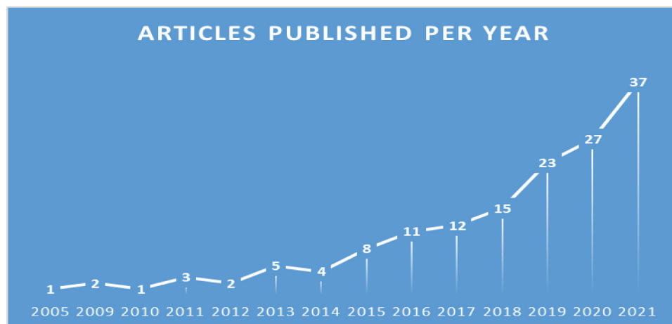
Figure 2. Annual Scientific Publication.

each referenced three times. Finally, Table 4 contains the rest of the theories in risk governance research, namely portfolio theory, decision usefulness theory, deep pocket theory, deposit money bank loan theory, helping hand theory and busyness theory. Few papers applied co-evolution theory, litigation theory, managerial hegemony theory, neo-institutional theory, option theory, grabbing hand theory, social mirror theory and value maximization theory.