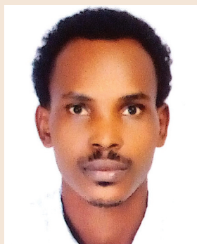
Dereje Fedasa Hordofa

Abstract: This study examined the influence of gender diversity on capital structure decisions among Ethiopian banks from 2010 to 2022. Clarifying the relationships between board composition and strategic financing choices carries academic and practical significance. Research questions focused on whether representation impacts leverage levels and the consistency of effects across contexts. The study aimed to address gaps in understanding governance's implications in developing markets like Ethiopia. Annual reports of 15 established banks provided data on leverage, gender diversity percentages, board size and other governance traits, profitability metrics, and bank-specific characteristics. Panel data techniques, including GMM regression, addressed endogeneity concerns. Key findings found gender diversity consistently correlated with lower debt utilization, aligning with