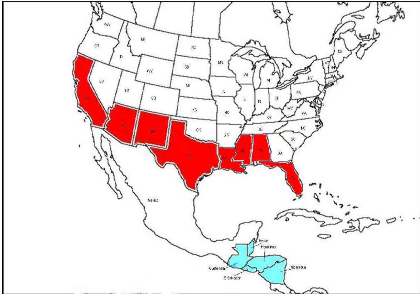
Figure 1: Central American Countries Affected by Hurricane Mitch and U.S. Southern States