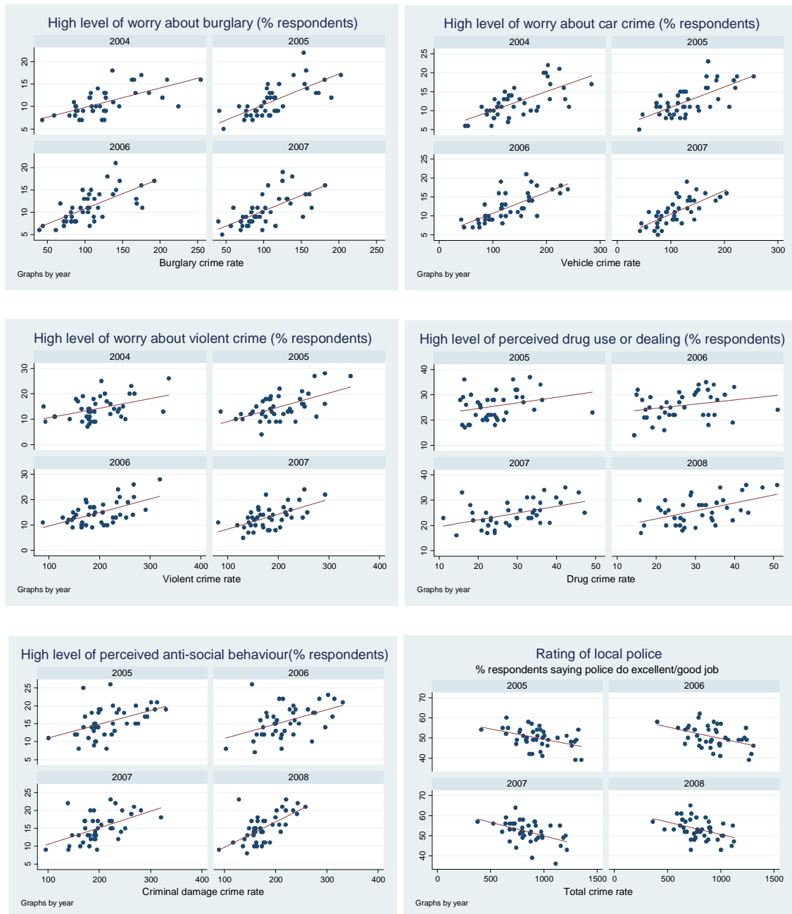
Fig. A 1 – Concern about Crime and Risky Behaviour, Rating of Local Police and Local Crime, by PFA; BCS data (2004-2008)

Note. Authors' calculations from British Crime Survey (BCS) data and UK Home Office recorded crime statistics.