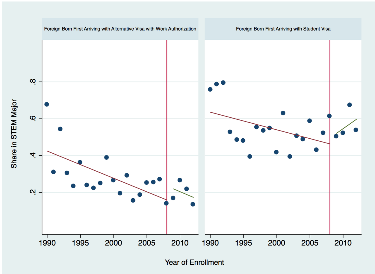
Figure 1. Share of STEM Majors by Entering Visa Type and Year of Enrollment

Notes: The sample consists of foreign-born individuals with a degree from a U.S. college or university ages 16 to 64, who either came to the United States on a student visa or on a visa, temporary or permanent, that allowed them to work. The vertical line depicts 2008, the year of the OPT extension.