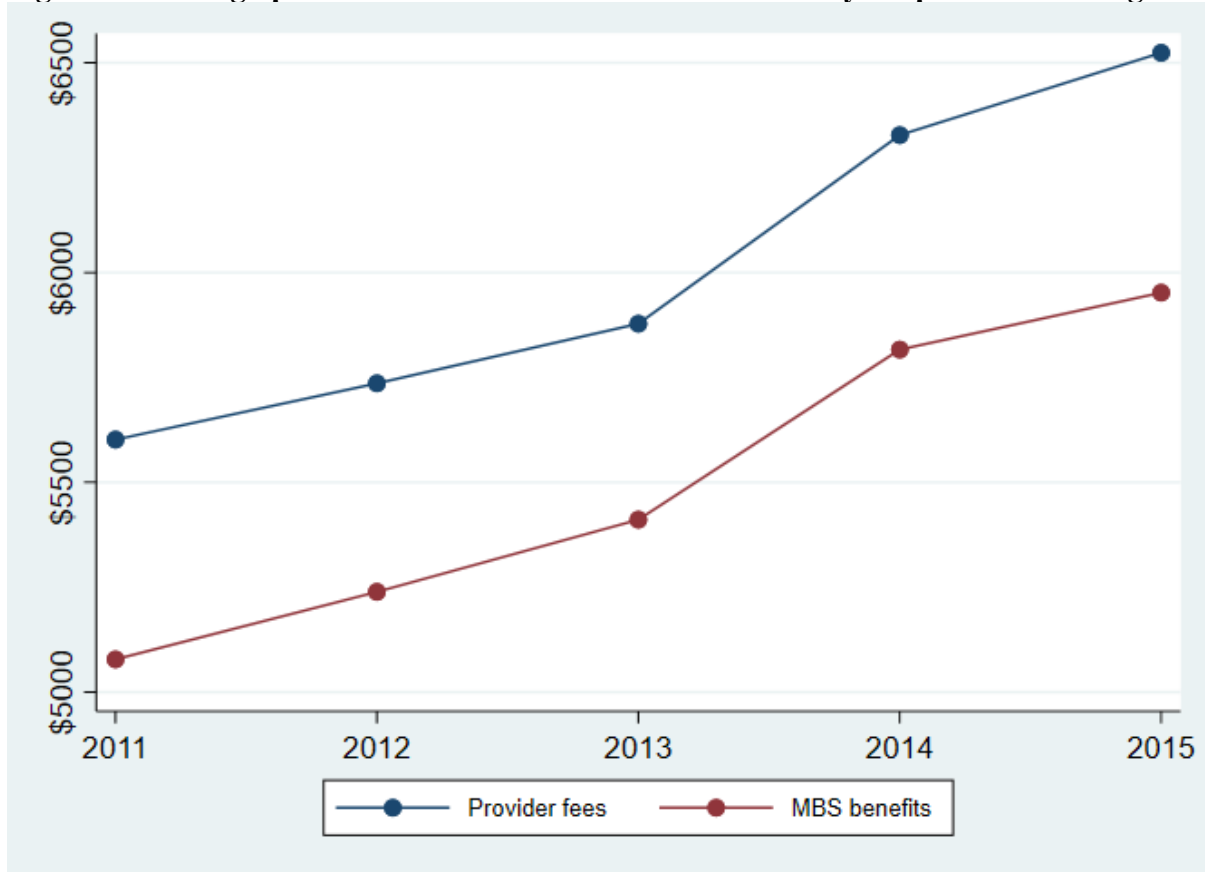
Figure 1: Average provider fees and Medicare benefits one-year post cancer diagnosis

Previous research suggests that OOP costs are unevenly distributed across the population (Jones et al 2008). Figure 2 presents the distribution of annual OOP costs incurred for out-of-hospital services by year of cancer diagnosis. In 2011 around 6% of the population group incurred no OOP costs and only 0.6% of the cohort incurred OOP costs greater than $5000 (blue color in figure 2). The distribution remains steady over time although there are some trends starting to emerge. First, a fairly steady 40% of each year's cohort incur a very modest OOP amount of less than $250 per year (maroon and blue colors in figure 2). However, an increasing proportion of the population is experiencing very high OOP costs particularly since 2013. In 2013, 2.55% of the population incurred OOP costs greater than $2000 per year and by 2015 this figure had increased to 5.13% of the population (red and purple colors in figure 2).