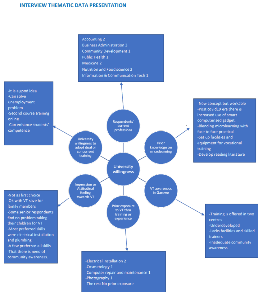
Figure 2: Interview Thematic Data Presentation

Additional data was collected through information in-depth interviews of academic and administrative staff, the results are hereby presented and analysed. Results are presented according to order of appearance during interview sessions.