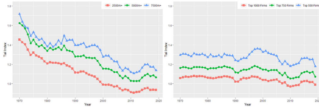
FIGURE 1. Time series of the tail index of the firm size distribution. The left panel depicts the tail index for each year during 1970–2019 for firms with real revenues above 2500, 5000, and 7500 million dollars. The right panel depicts the tail index for the top 500, 750, and 1000 firms.

of real revenue and firm ranking. A tail index is estimated for each year during 1970–2019 and by the approach proposed by Gabaix and Ibragimov (2011). The left panel of Figure 1 shows the results for firms with real revenues above 2500, 5000, and 7500 million dollars, whereas the right panel shows those for the top 500, 750, and 1000 firms. Both panels show that the tail index generally declines over time, which is consistent with the recent rise of top firms; see, e.g., Gabaix and Landier (2008), Autor, Dorn, Katz, Patterson, and Van Reenen (2020), and De Loecker, Eeckhout, and Unger (2020). 23