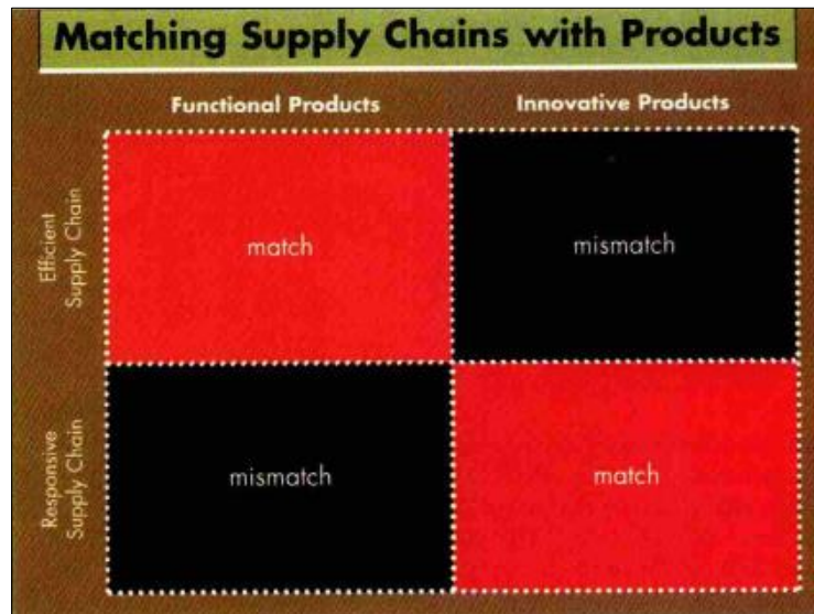
Figure 1: Matching Supply Chains with Products (Fisher 1997)

Because of this situation, many companies have found themselves in a supply chain situation over the last few decades where they had focused so much on efficiency that they had the wrong supply chain for an appropriate balance of loss revenues vs. cost savings. Finally, the instability of global supply chains has made many supply chains much less agile than before. For example, while sourcing from the PRC was, for many companies, quite flexible thanks to the responsiveness of Chinese suppliers, the reality of the transport situation has made those supply chains lose much of their agility.