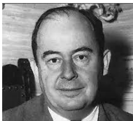
John von Neumann

Von Neumann considered general two-person zero-sum games where the numbers of pure strategies might be any finite number rather than 2, and the payoff structure is general. The most important result of von Neumann (1928) reads as follows: In any two-player zero-sum finite game, there exists at least a mixed equilibrium.