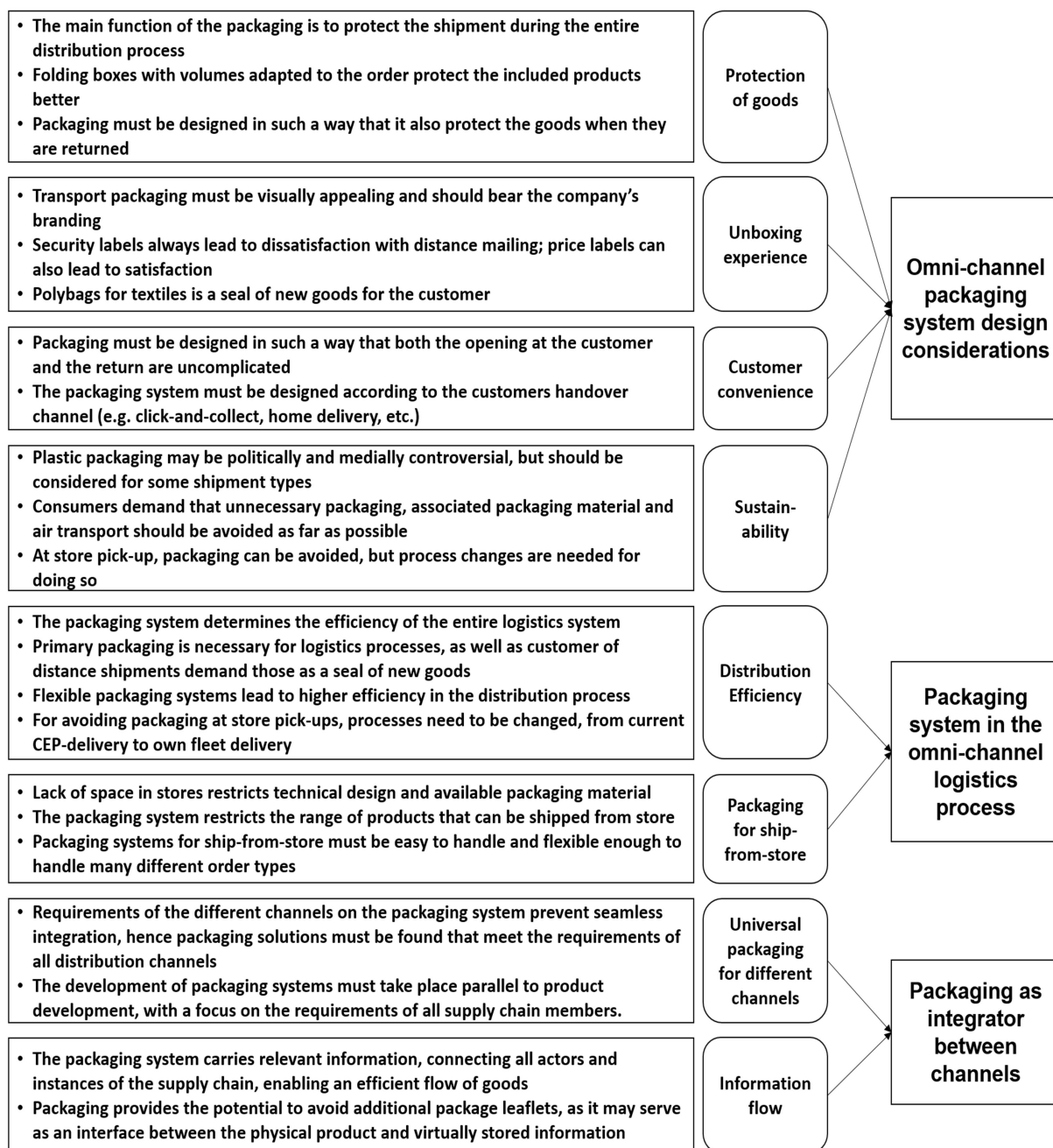
Figure 2: First order concepts, second order themes and aggregated dimensions