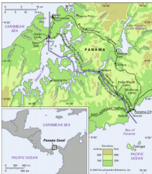
Fig. 2: The Panama Canal.

The construction of the Panama Canal has begun in 1880 by the French government. The US government completed it in 1903. Since its opening in 1914, it has been hugely successful in linking maritime traffic between the Pacific and Atlantic Oceans. The man-made channel is approximately 50 miles long and it is comprised of a system of artificial lakes, channels and locks (Figure 2). The Canal is administered by the country of Panama [15]. In 2016, its expansion works were completed. It aims to meet growing demands, ensure the competitiveness of the Canal over other maritime routes and increase the contributions of the Canal to the Panamanian State [16].