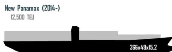
Fig. 3: Neo-Panamax Dimensions (Source: [15])

The scenarios performed in this study has compared routes using the vessels that are now able to cross the new canal locks - Neo-Panamax vessels has a capacity of 120,000 DWT (deadweight tonnage - unit of measurement of total ship weight capacity, considering gross weight cargo, fuel, potable water, groceries, crew and belongings). The Neo-Panamax ship has the maximum allowed dimensions in the third and new set of locks. The Panama Canal Authority (ACP) allows only vessels that are up to 366 meters long, 49 meters wide and 15.2 meters deep to cross [20]. According to [21], the greater the capacity of ships the lower the operational costs for maritime fees and charges. Therefore, Neo-Panamax presents itself as the best option in terms of load capacity for loads transportation through the canal. The dimensions of this vessel are shown in Figure 3. Thus, it will be used in the analyses for comparative purposes.