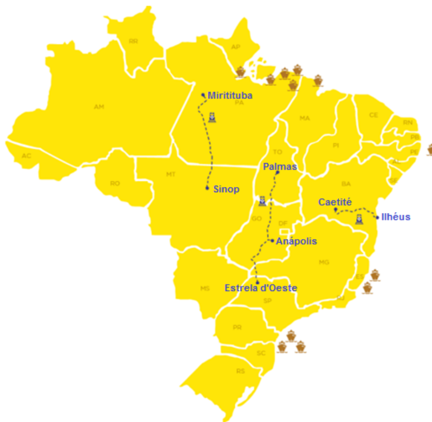
Fig. 4: Planned investments by the Brazilian government for railway and port infrastructure

The reason for not limiting PRG capacity in C2 is the investments that will be made up until 2020 to expand this port. VIX will also receive investments; however, this port is predominately used for the outflow of iron ore to China, so there should be no significant increase in the volume of soybeans exported. SSZ and SFC are not yet targets of investments by the Brazilian government in improvements or expansion. Figure 4 shows that in addition to investments in VIX and PRG, and the port of Suape, in Recife, STM and VDC will also undergo improvement projects until 2020. Also, the new railroad projects due to be inaugurated by 2020 are highlighted, standing out the Ferrogrão undertaking that will connect Sinop - MT to the port of Miritituba, located in the state of Pará.