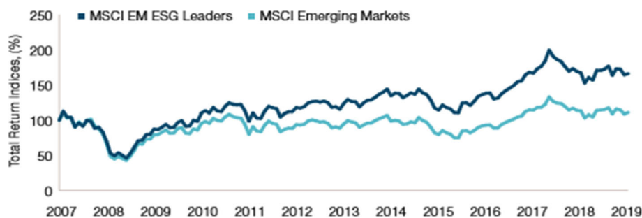
Fig. 3 Cumulative Gross Index Return (September 2007 to September 2019).

As taxonomies are being developed, one issue that's arising is finding the right balance between. Taxonomies provide all market participants and consumers with a common understanding of qualifying activities, protects against green washing and provides the basis for further policy actions, including standards, labels, incentives and potential changes to prudential rules. Countries will need to determine what works best for their circumstances and how much to develop their own taxonomy or draw on others.