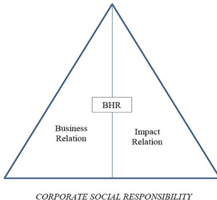
Fig. 1 Reconceptualised CSR, BHR and corporate accountability

voluntary initiatives beyond the scope of business relation and impact relation are categorised as CSI.