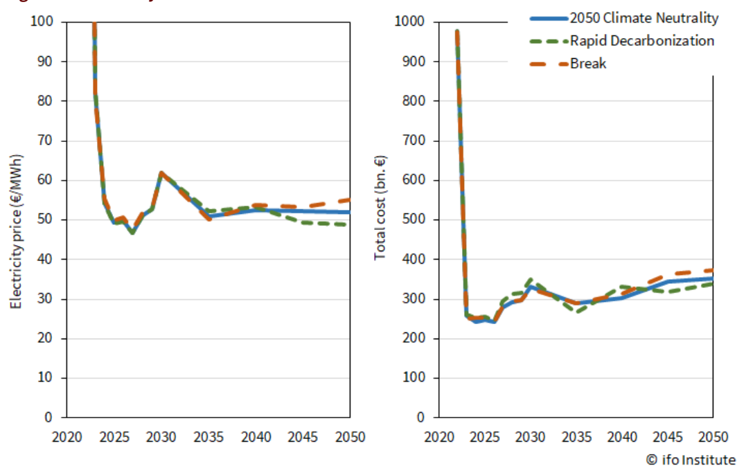
Figure 2: Electricity Prices and Total Costs of Climate Protection

natural gas experiences a renaissance in 2030 and beyond, mainly because of the combination with carbon capture and storage (CCS). Wind power is expanded excessively, but solar power sees only small increases. Bio-CCS becomes part of the technology mix in 2035 (Rapid Decarbonization). The differences in the possible expansion of transmission line capacity become relevant from 2040 onwards, when considerable amounts are traded (almost one in four units of electricity), while electricity storage is important but still a niche compared to the total amount of electricity traded internationally.