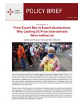
From Export Ban to Export Acceleration: Why Cooking Oil Price Interventions Were Ineffective

Go to our website to access more titles: