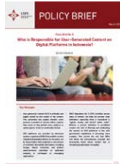
Who is Responsible for User- Generated Content on Digital Platforms in Indonesia?