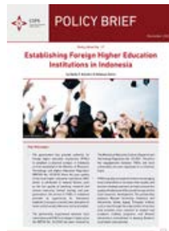
Establishing Foreign Higher Education Institutions in Indonesia