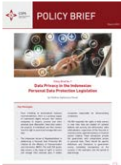
Data Privacy in the Indonesian Personal Data Protection Legislation