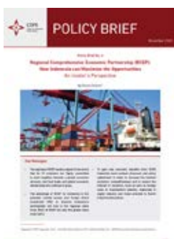
Regional Comprehensive Economic Partnership (RCEP): How Indonesia can Maximize the Opportunities