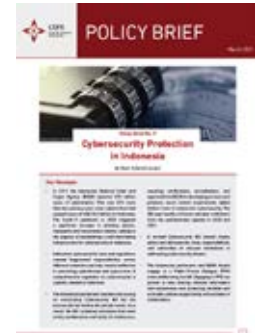
Cybersecurity Protection in Indonesia