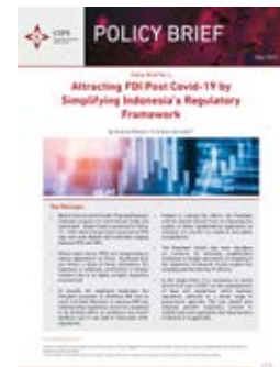
Attracting FDI Post Covid-19 by Simplifying Indonesia's Regulatory Framework