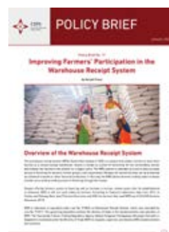
Improving Farmers' Participation in the Warehouse Receipt System