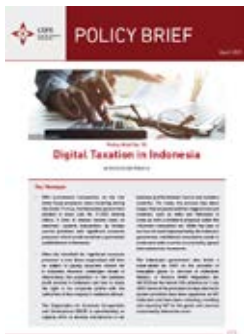
Digital Taxation in Indonesia