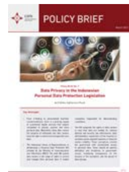
Data Privacy in the Indonesian Personal Data Protection Legislation