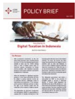
Digital Taxation in Indonesia

Go to our website to access more titles: