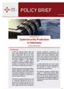
Cybersecurity Protection in Indonesia