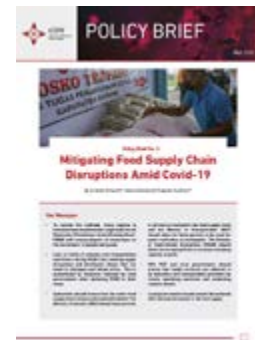
Mitigating Food Supply Chain Disruptions Amid Covid-19