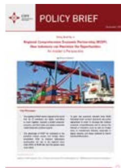
Regional Comprehensive Economic Partnership (RCEP): How Indonesia can Maximize the Opportunities An Insider's Perspective