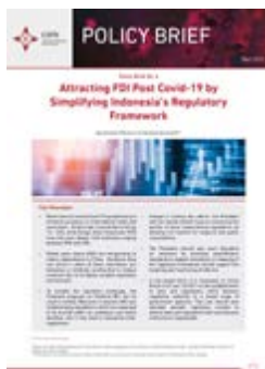
Attracting FDI Post Covid-19 by Simplifying Indonesia's Regulatory Framework