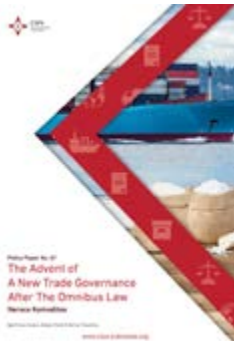
The Advent of A New Trade Governance After The Omnibus Law: Neraca Komoditas