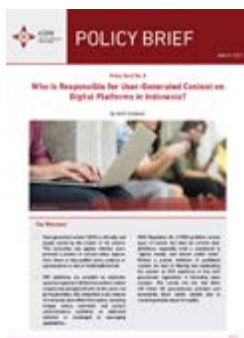
Who is Responsible for User-Generated Content on Digital Platforms in Indonesia?