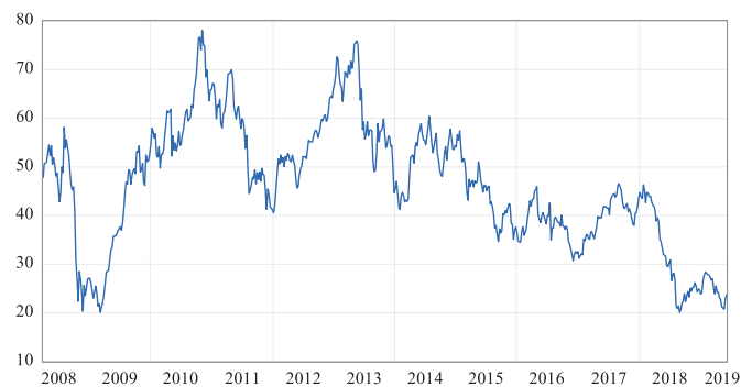
Fig. 1. iShares MSCI Turkey ETF Net Asset Value (mio USD).

The closing price of USD/TRY exchange rate is retrieved from Bloomberg as weekly frequency for the period from March 28, 2008 to June 07, 2019. We use weekly return rather than price (exchange)