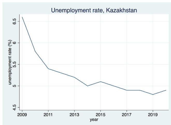
Fig. 2. Historical unemployment rate in Kazakhstan from 2009 to 2020.

In the context of developing countries with heavy reliance on natural resource extraction, currency devaluation is another important shock to consider. Aside from generating public outrage, it usually leads to higher inflation. Rising prices, in turn, lead to higher spending on basic consumption. A recent working paper Colicev et al. (2022) examines the depreciation of the Kazakh tenge against the US dollar in August 2015. The study estimates exchange