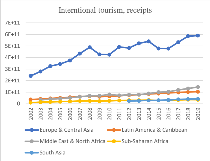
Figure 1. International tourism, receipts, 2002-2019