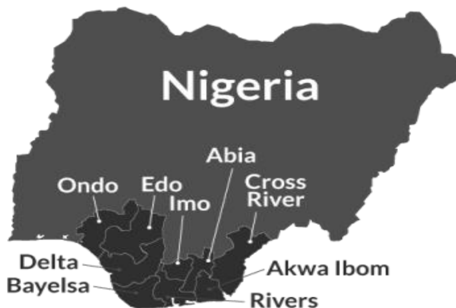
Figure 1: Constituent administrative states of the Niger Delta, Nigeria