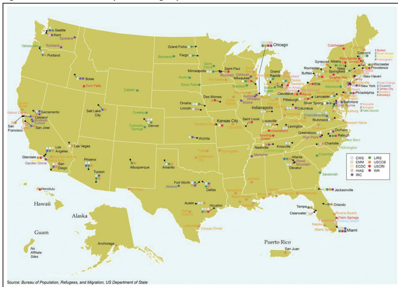
Figure 1 Resettlement sites by volunteer agency.