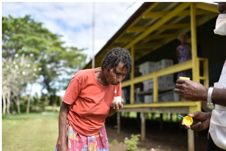
Fig. 2 Patient with suspected TB – MSF (2014)

trial phase, initial signs indicate that this may be a useful method of connecting remote health centers to otherwise inaccessible hospitals in the future. MSF considered this pilot project to be just a trial of the technology and did not carry out a comparative analysis of costs to determine whether payload delivery by drone would be less costly than by car. The main benefits were reduced delivery time and being able to avoid the risk of driving a vehicle through very difficult topographies (FSD 2016).