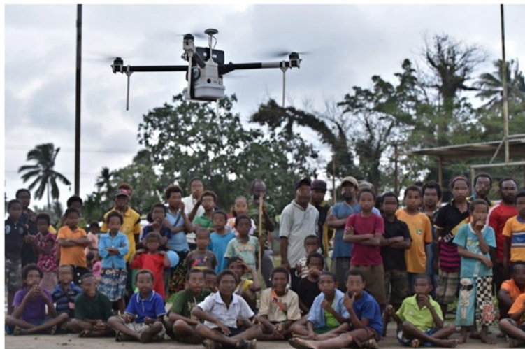
Fig. 1 UAV demonstration flight – MSF (2014)

Currently, the UAVs are capable of traveling at up to 60 km/h with a maximum range of 28 km in favorable conditions and can only carry a light payload. However, it is predicted that their range will increase rapidly in the coming years as new lighter and longer-lasting batteries are being developed. The UAVs may also be launched by a smartphone, with the goal that non-technical staff can operate them without assistance. While there is still fine-tuning of the UAV system that needs to be done during the