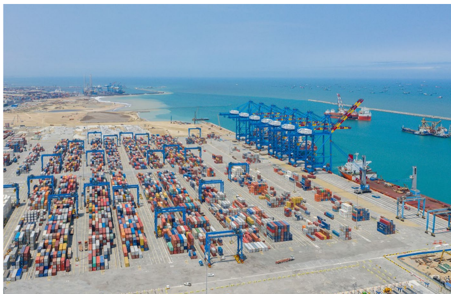
Fig. 2 View over the new Meridian Port Services terminal.

after the finish of the new MPS terminal. The new MPS terminal is a modern, highly automated self-service port from entry, control, and direction to exit, with advanced information technology (IT) and biometric scanning and routing tickets for truckers.