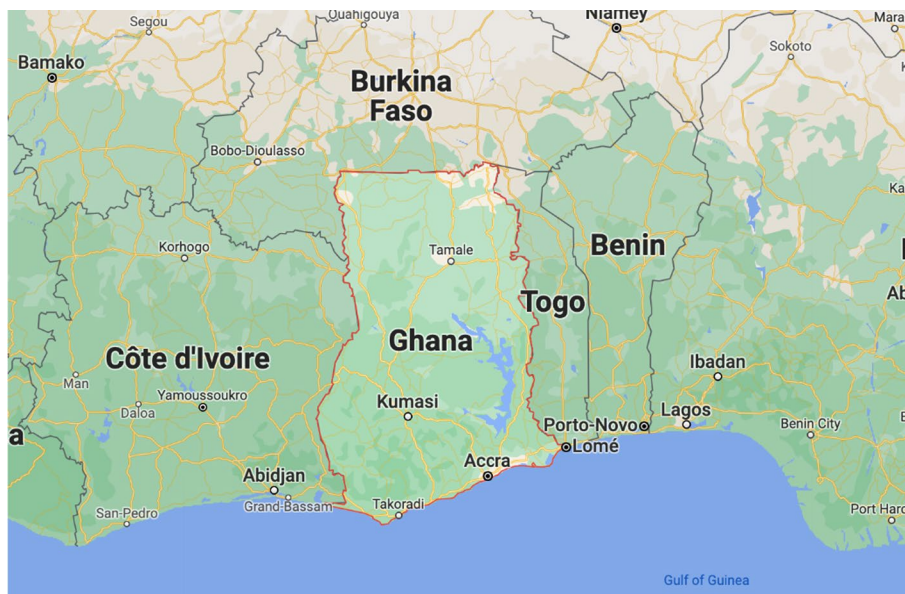
Fig. 1 Local geographical overview—the competitive situation.