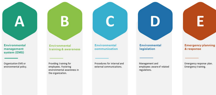
Fig. 1 Environmental performance tool for environmental management

Has the organization taken these issues into account YES/PARTIALLY/NO?