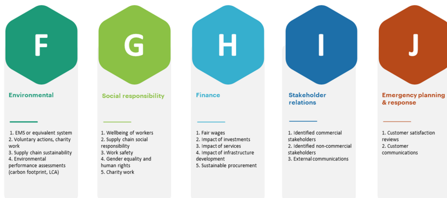
Fig. 2 Environmental performance tool for sustainability

Has the organization taken these issues into account YES/PARTIALLY/NO?