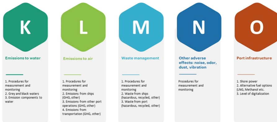
Fig. 3 Environmental performance tool for environmental impact

Has the organization taken these issues into account YES/PARTIALLY/NO?