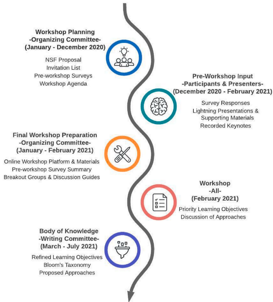
Fig. 1. Workshop timeline.

Global Engineering; (2) the most important skills for work in the global development sector; and (3) knowledge and skills missing from current graduate programs in Global Engineering. This input was summarized and shared with respondents for review before the workshop, to serve as a starting point for discussion.