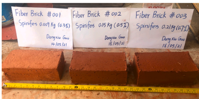
Fig. 2. Mudbrick reinforced by Spinifex fibre which is wildly used by Indigenous people in tool making.

An example of a potential local material is fibre-reinforced mudbrick. Indigenous people used different types of natural fibres for making tools, bindings for connecting building materials, containers and rafts (Gott, 2008; Miller, 2021). Research done at CDU in 2021 (GUO, 2021) found that if fibres of the right thickness and length are used in mudbrick, the strength and erosion resistance of bricks could exceed the minimum requirements needed for housing. Fig. 2 shows some samples made in this research. Indigenous use of spinifex in artefacts and the community stories around this technology encompass a large body of knowledge on selection, application and sourcing the right natural fibres for building applications.